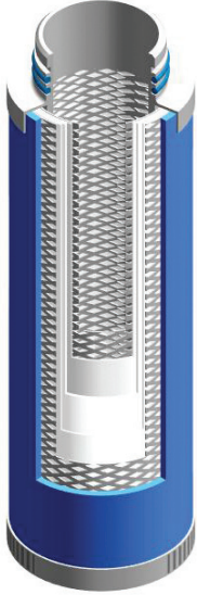
FF, MF & SMF

Cross section of the Coalescing Depth Filter Elements