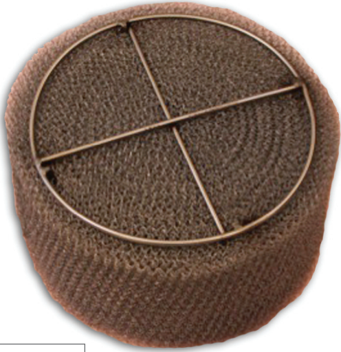
Wire Mesh Separator, Coiled Construction with Supporting Grid