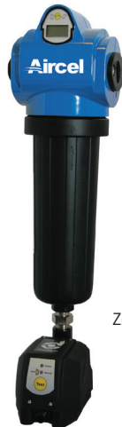
Shown with Electronic Zero-Loss Drain