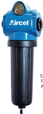
Shown with Float-Style Auto Drain